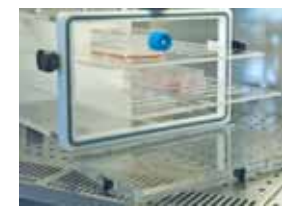
1, 2 or 3 shelves