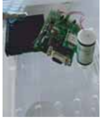
O 2 sensor & data logging

Experimentation with modified atmospheres, hypoxic gas mixture and volatile compounds