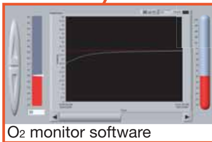
O 2 monitor software