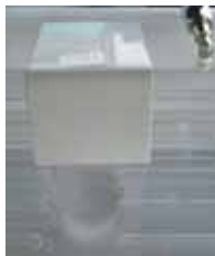
O 2 sensor cover